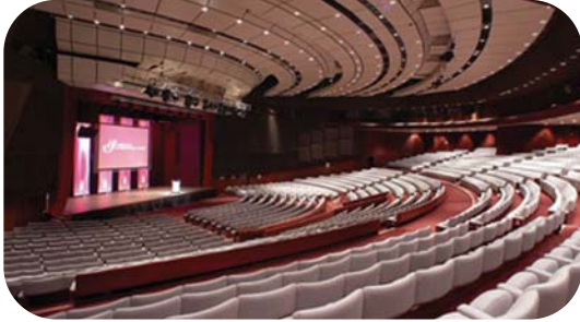
The Harrogate Auditorium